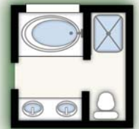
Opt. Double Vanity, Shower & Graden Tub in Master Bath